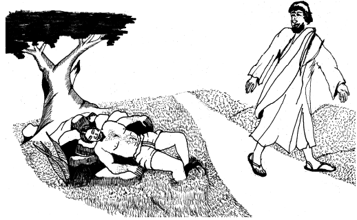
Lawi-nxaeē tl'apumeedtōga cāgee hewegkimeēts'a tl'e'ē hik'i

cāgeei', bpa moogkumua cāgkwee. 34 Bpa ma'ets'ea zabibu- k'ame'iga komerēga nxokowaagkwe, nīgā tchāga nxi'waā lhaa hic'awaagkwe. Bpa hewe-dak'weenaa gkegkwee, nīgā wagini x'ots'e koots'a nxeegkaā o'a iē k'wawesugku.