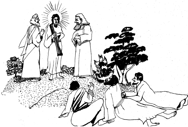
Yesū, Musā nī Eliyagkiaa neē sayo

32 Hiisii Petro nī wa'amāso ura' neē x'o. Hia' haangai' aa Yesūga' cā na'a iē hewe-ba'oo-bpaangkī'iga nī haaso ncomosōso gkisosōso hewekhigki lheē neesisōsoa' ca'ī.