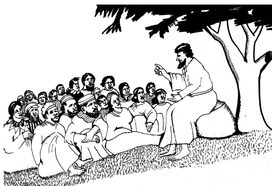
Yesū haagkits'a iē ncomosoa somasugku

lhaau tchia'ōtche. Mariāsu hewesa malhee, nī hewe dtedtegkweets'eīgki tlaagki.”